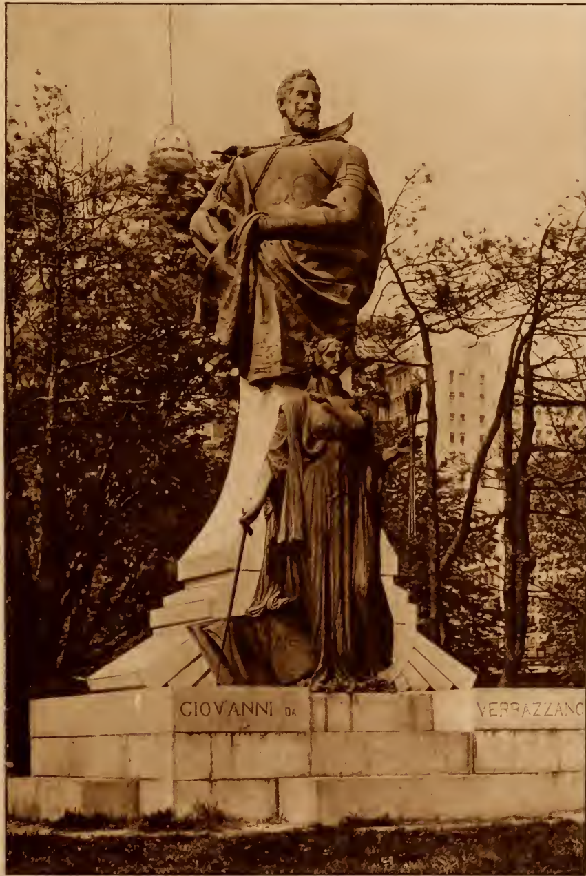
STATUE OF GIOVANNI DA VERRAZZANO.